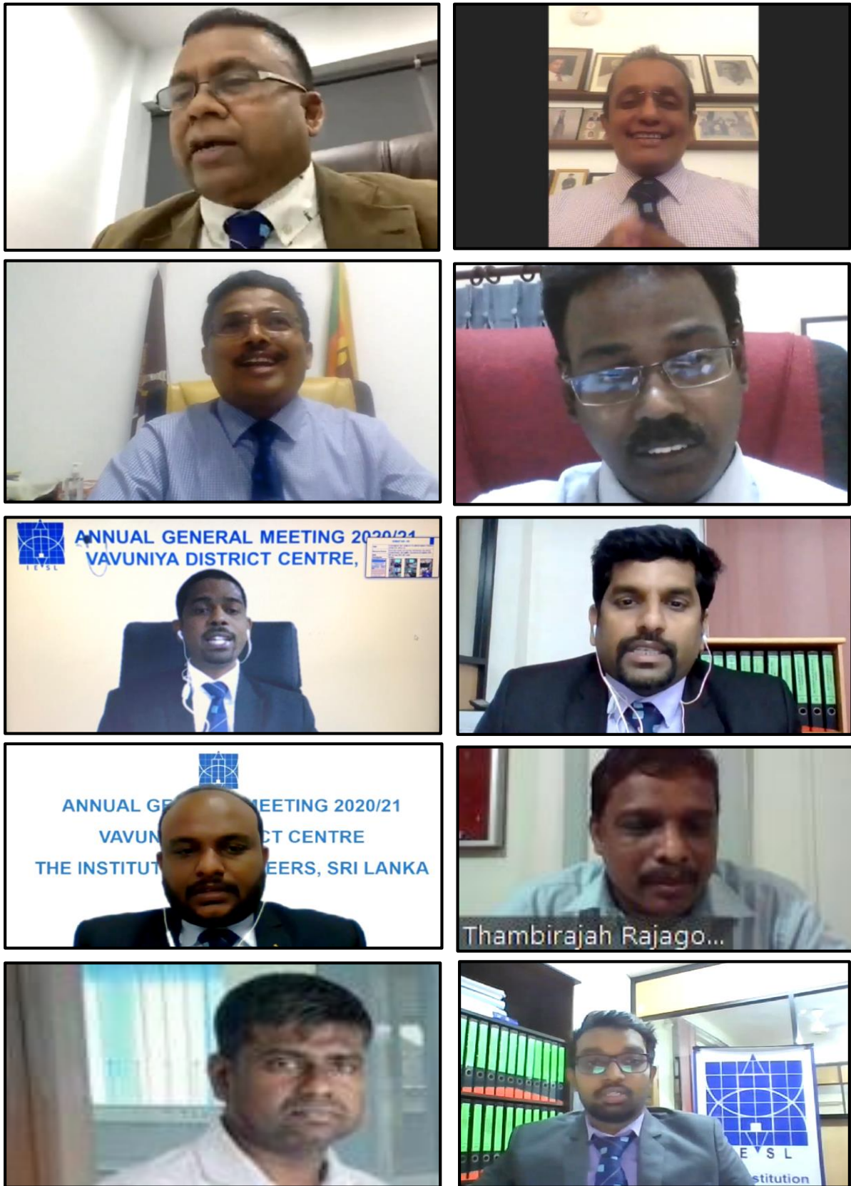
Figure 2: Guests and Committee Member of VDC